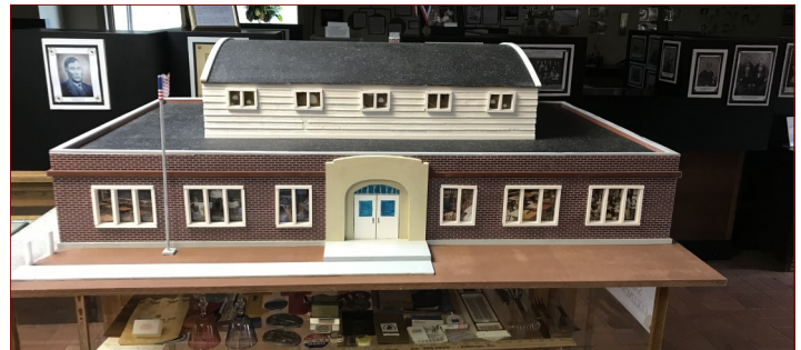
A model of Talmage School building created by Roger Watt and Ronnie Phillips.

After the program, the co-authors will sign and sell the Kansas Guidebook 2 . The 480-page, coil-bound book is chock