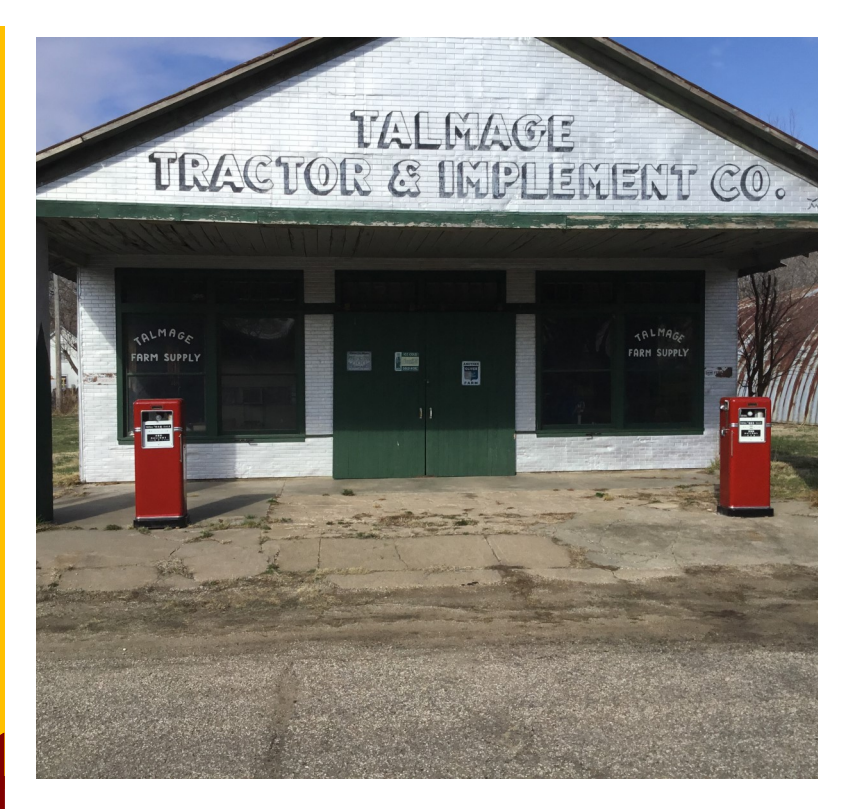
Terry Lake recently placed two old gas pumps in front of the old Bebermeyer Talmage Tractor & Implement Co. in Talmage. His renovation of the building has really dressed up Main Street. Thank you, Terry!