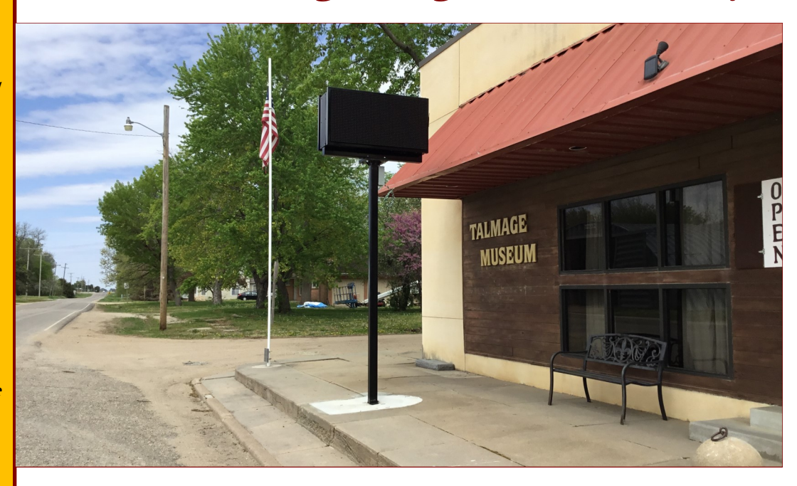
The new LED digital sign is set and will soon be announcing community events.

The new LED digital sign was set on its post on Friday, April 26.