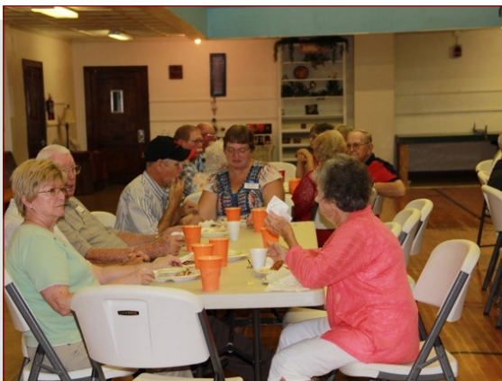
Former students visit at the reunion.

I have also enjoyed adding special photos of cheerleaders from each year, as well as the boys basketball teams.