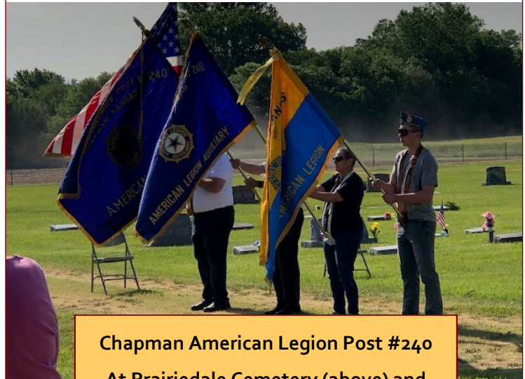
Chapman American Legion Post #240 At Prairiedale Cemetery (above) and Indian Hill Cemetery, Chapman (below)