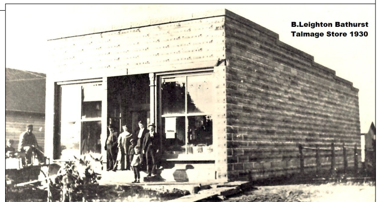
B. Leighton Bathurst Talmage Store 1930